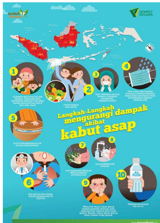
Caption: Sample of community health education by health partner